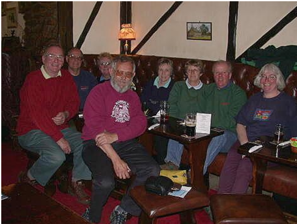
Canal Society members relaxing after their walk. Fuller details of the Boat Gathering will appear in the next Newsletter.

WALK 3: SUNDAY 22nd JUNE. Meet at 10.00 a.m. outside Braunston Village Hall. To cover the eastern section of the village/High Street including The Green and the canal from Butcher's Bridge to Bottom Lock. c.2 miles. c. 3 hours. To be led by Chris Pardoe.