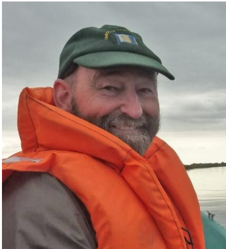
Not in GNASHERS II ! But on the Volga Delta in Russia