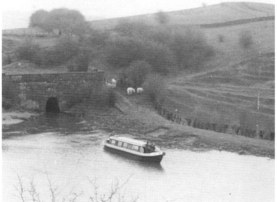
Leek Tunnel on the Caldon Canal

The main contractor, Gleasons, are ready to sign a contract and are planning on starting all the main works from April and carry on throughout the summer. All the main items are to be completed by the end of September 2000 with landscaping etc. running on to the end of the year and possibly into Spring 2001. British Waterways will operate the link, once completed and open to boats in mid-2001.