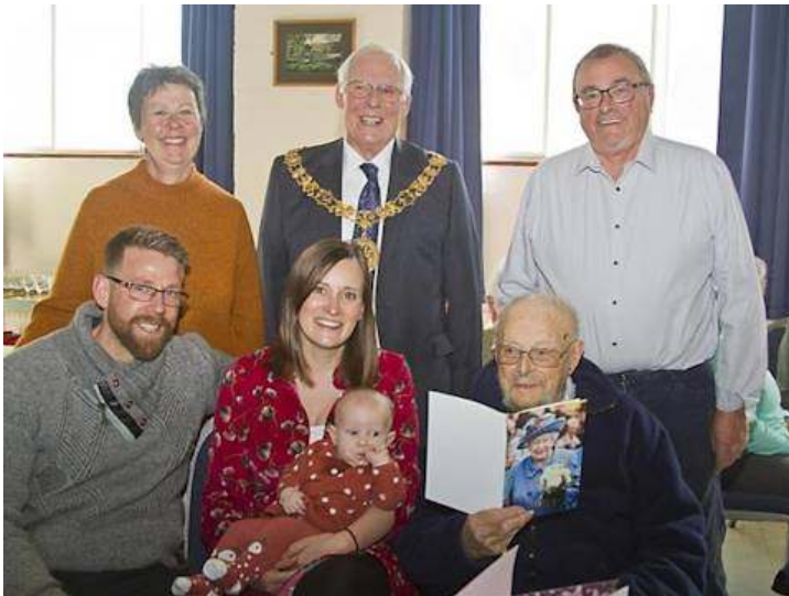
picture of the former SCS member proudly displaying his birthday card from the Queen!

Although he is no longer a member, I am sure older members would like to know that smoke from his pipe and all the bonfires which he lit on Society working parties can't have done him much harm! Here is a