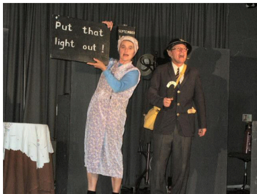
We have no picture of their 1997 performance but above is one of their production "Put that light out!" taken at Chilworth in October 2008

Our 30th Anniversary Party was celebrated in style by about 75 members and friends with a visit by the Day-Star Theatre Company and an excellent buffet.