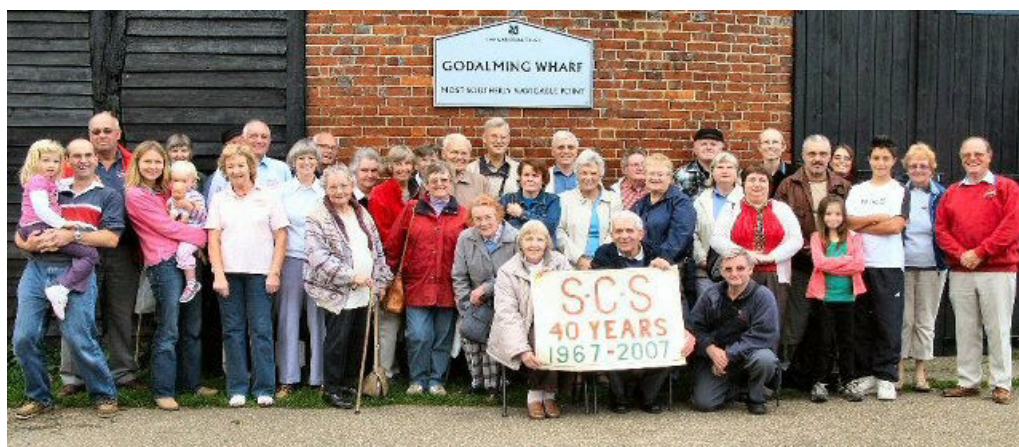
Society members and guests thoroughly enjoyed their visit to the River Wey and Godalming Navigation on Saturday 6 October 2007 celebrating the 40th anniversary. Some of us have not changed!!