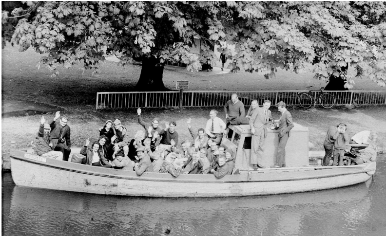
Above: SCS members on KELSTON before departure from Newbury on 3rd September 1967