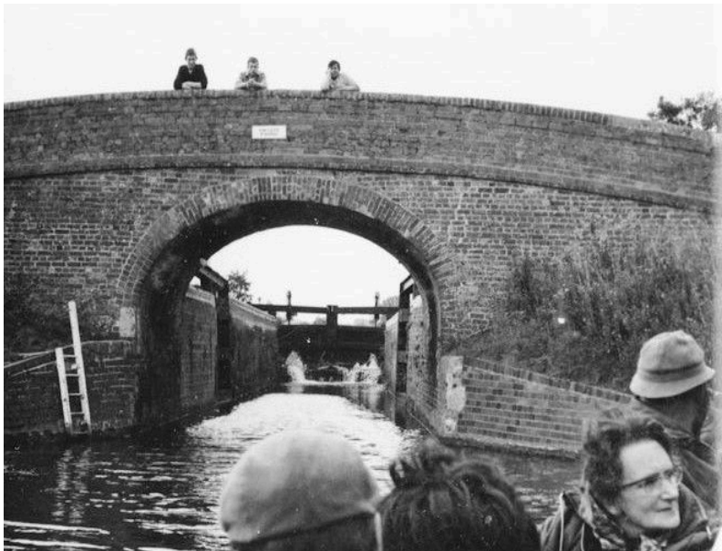
Bottom: Returning through Newbury Lock