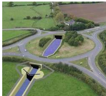
Artist's impression of part of new canal to pass under A38/A419 roundabout

"Our designated funds programme was developed so that we can