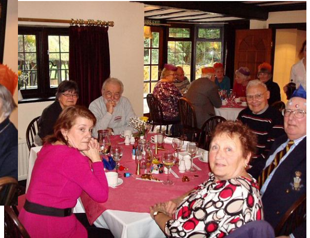
Members enjoying themselves during the recent lunch at the Blue Hayes Restaurant.