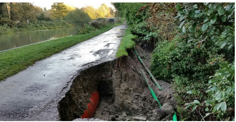
Kennet & Avon Canal towpath near Devizes

"It really couldn't have happened in a worse spot – the pound above Kennet Lock is the longest on the whole canal, so we're talking about a lot of water rushing down the Caen Hill flight, which has caused the damage.