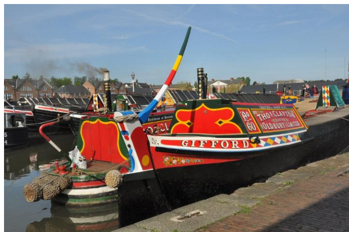
Narrow boats Spey and Gifford at Ellesmere Port, Easter 2011