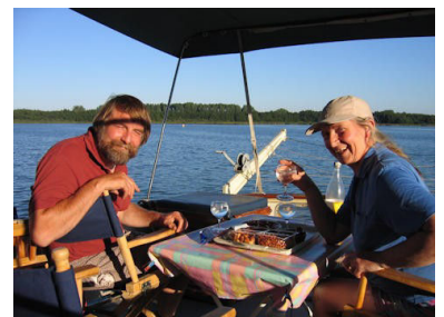
East Germany: "The sun has just gone down over the yard arm".