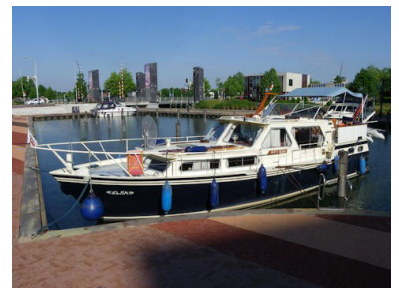
Elsa moored in Holland.