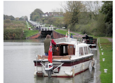
Prinsesse Estrith waiting to ascend Caen Hill Locks on the Kennet & Avon.