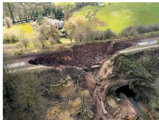
The breach as seen from a drone.