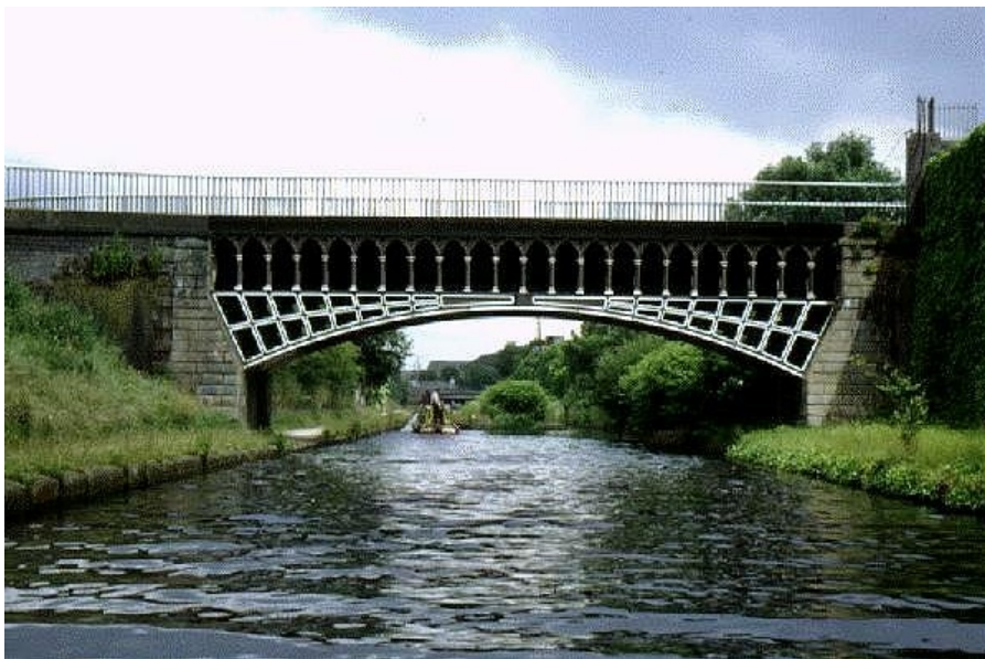
The Telford Aqueduct carrying the Engine Arm over the BCN New Main Line at Smethwick, pictured in June 2000.