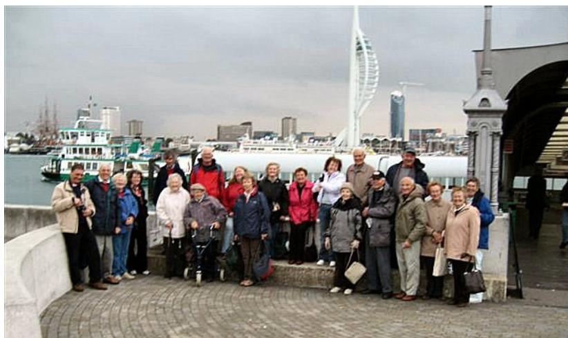
Above: Society members on the quay at Gosport

We sailed up the River Itchen as far as the Itchen Bridge seeing the new developments along the river from a different perspective, soon to be joined by further development on the old Vosper-Thorneycroft site.