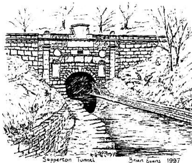
The eastern portal of Sapperton Tunnel on the Thames and Severn Canal