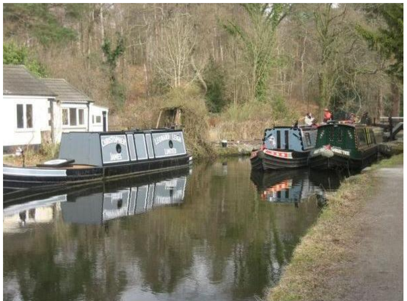
Basingstoke Canal reopening cruise Easter 2013, Leaving Deepcut Top Lock

The canal remains open whilst water supplies last, and it is incumbent on boaters to show the Councils that their investment has been worthwhile by paying a visit. Further work is being undertaken at Deepcut Flight and this was not due to fully reopen until 22nd April.