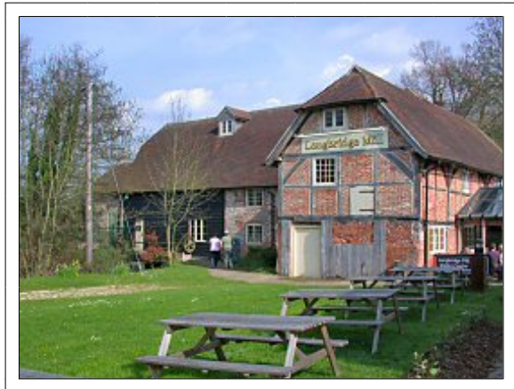
Top left: Whitchurch Silk Mill. Upper right: Machine for winding silk threads onto bobbins. Lower left: Part of the floor where corn is ground. Lower right: Longbridge Mill.