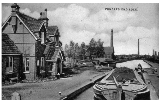
Ponders End Lock