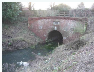
The Greywell Tunnel portal and canal banks after recent clearance

now visible from the towpath at a distance. Bank clearance will continue along both banks as far back as the derelict Lock 30 (about 100m away), which will also be exposed once again.