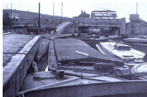
Tottenham Lock pre 1960

Next we travelled along beside miles of reservoirs controlled by Thames Water which allows plenty of bird watching and fishing. We then pass under the North Circular road using the Art Deco bridge.