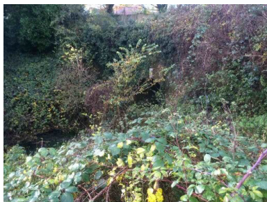
How it looked in November 2014. The keystone is just about visible here

The Greywell Tunnel is around 1200m long and extends under Greywell Hill in a westerly direction. It marks the beginning of the last 5 miles, the now derelict (and in some places, obliterated) section of canal that once wound its way into the centre of Basingstoke. The tunnel has long since been impassable since collapses occurred towards the western end in 1932 and again in the 1950's. In addition, it is now famously one of the most significant bat roosts in Britain. Both of these factors make it highly unlikely that the tunnel will be ever navigable again.