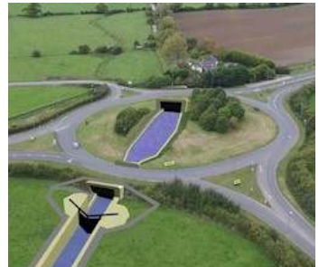
Artist's impression of part of new canal to pass under A38/A419 roundabout