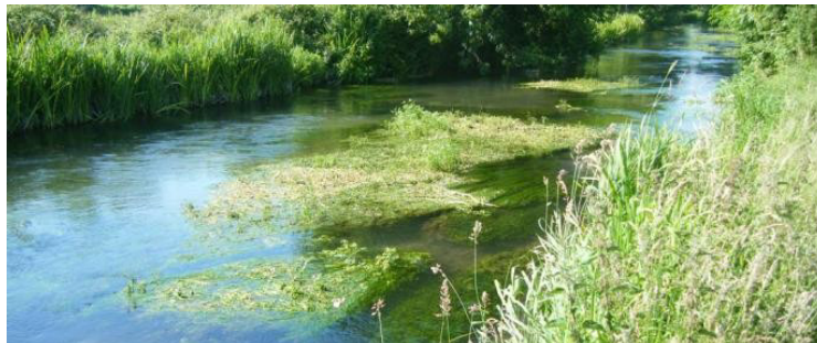
Above: River Itchen; Below left: Southern Damselfly; Below right: Kingfisher

Too much is being taken from 550 bodies of water in England and Wales, an analysis shows, including some of the finest chalk streams where flow has been reduced to a trickle.