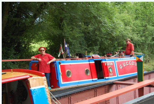
The Chairman and Secretary seen on their boat Purton at the recent Braunston Historic Boat Rally

https://www.waterways.org.uk/news/view?id=270 7 June 2016