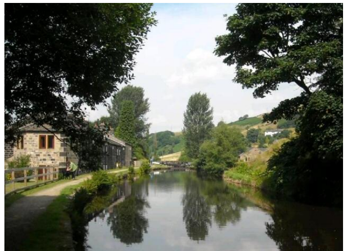
Picturesque Rochdale Canal at Bottomley Lock

Although an early start is still the official advice, the Ashton canal continues to improve, and the passage to Ancoats was busy with boats. The new marina and the adjacent tram station at New Islington provide good moorings, convenient for the start of the