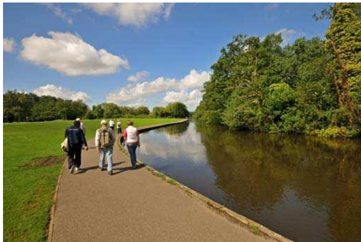
Walkers in Riverside Park by Dennis Bright

These walks are perfect if you want a shorter walk than the whole 10.5 mile Itchen Navigation Heritage Trail route. The circular walks