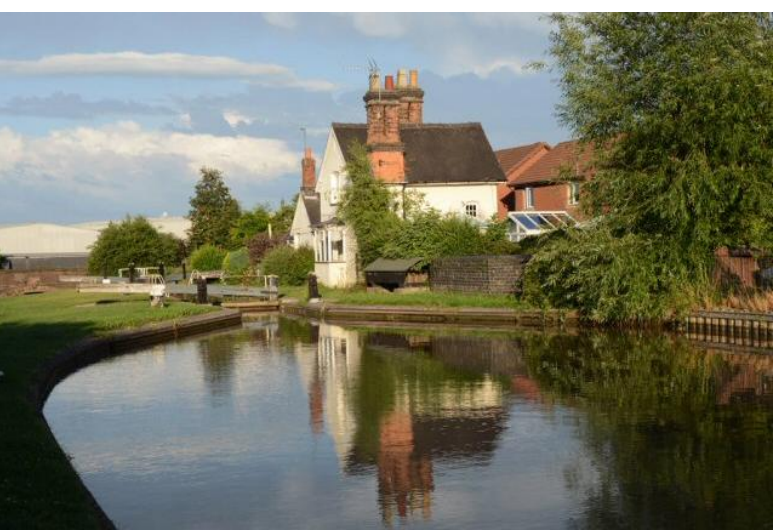
Wardle Lock, Middlewich.

A Mystery Boat; A Bridge 'ole; Submarine on the Thames!; MoorlandView; Droitwich Basin; A Thrush in Winter and the winner: