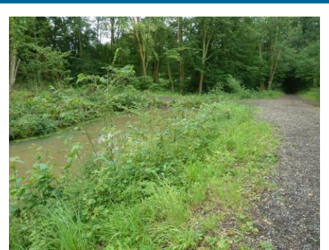
Above: The site of Gennets Bridge Lock. Below: Southland Lock (½ mile to the south) nears completion in December.

Reconstruction of Gennets Bridge Lock marks the next stage in the efforts by the