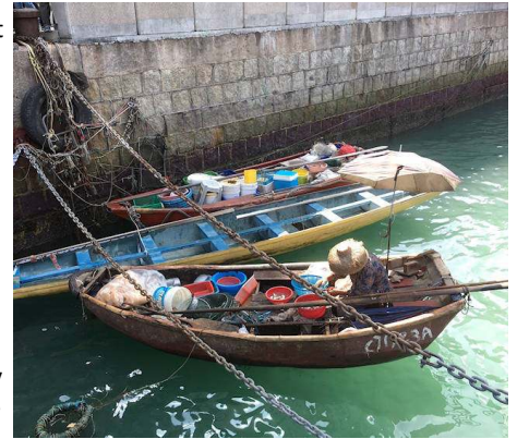
Above: An old lady gutting and de-scaling fish. Below: Dried fish at Aberdeen Harbour