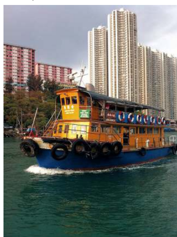
Left: Chuen Kee ferry leaving Aberdeen Harbour. Right: My view across from over The Bay restaurant in Mo Tat Wan village on Lamma Island across to Hong Kong Island.

The best way to travel is sitting on the deck in front of the driver as the boat travels from the village to Aberdeen fish market on the south of Hong Kong Island. Huge container ships pass at regular