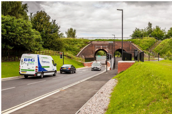
Above: James Street Aqueduct after repairs