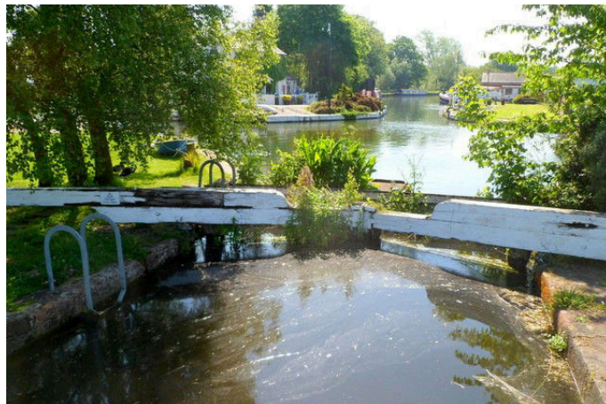
Above: Disused Saul Junction Lock before repairs