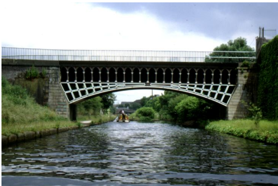
The Telford Aqueduct carrying the Engine Arm over the New Main Line, Birmingham Canal Navigations