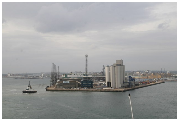
Dock Head, Southampton

over this month. Details of Society events in the near future are given in the Chairman's Column above.