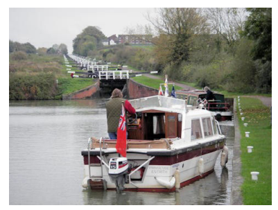
Prinsesse Estrith waiting to ascend Caen Hill Locks on the Kennet & Avon.

"In October 1985 we purchased just the hull and superstructure of a Viking 23 [cruiser]," Myra says. "It took three years to fit out the boat and, in October 1988, Prinsesse Estrith was