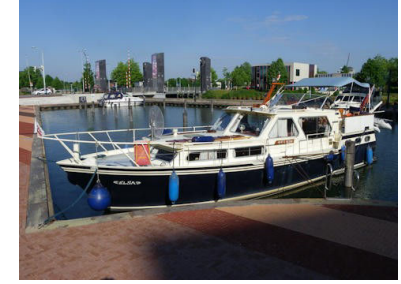
Elsa moored in Holland.