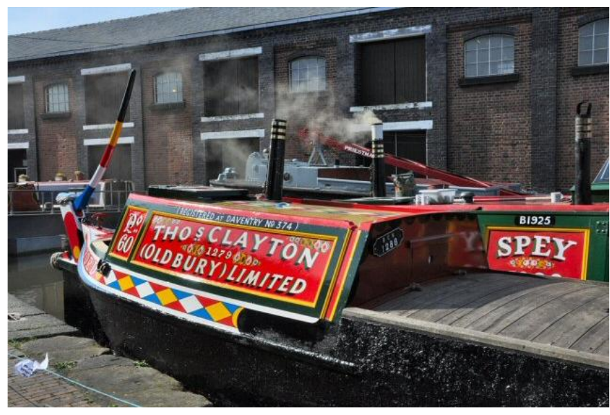
Above: The newly painted Gifford paired with Thos Clayton motor boat Spey Below: About eighteen historic boats moored in Salthouse Dock close to the centre of Liverpool

With a start at around 5.30am some of the pictures were a bit blurry, but eight boats assembled ready to go to Eastham. Here the "big" lock, the largest canal lock in the country, dropped them